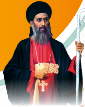
OUR PATRON SAINT St. Gregorios of Parumala